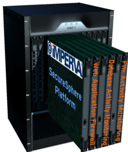
IMPERVA ON CROSSBEAM